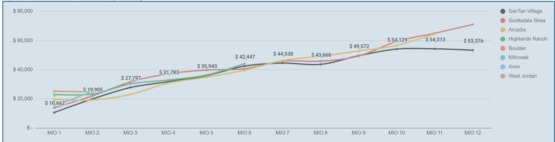
System Net Sales on a Monthly Basis ¶