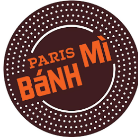
EXHIBIT A TO PARIS BANH MI FRANCHISING LLC FRANCHISE DISCLOSURE DOCUMENT