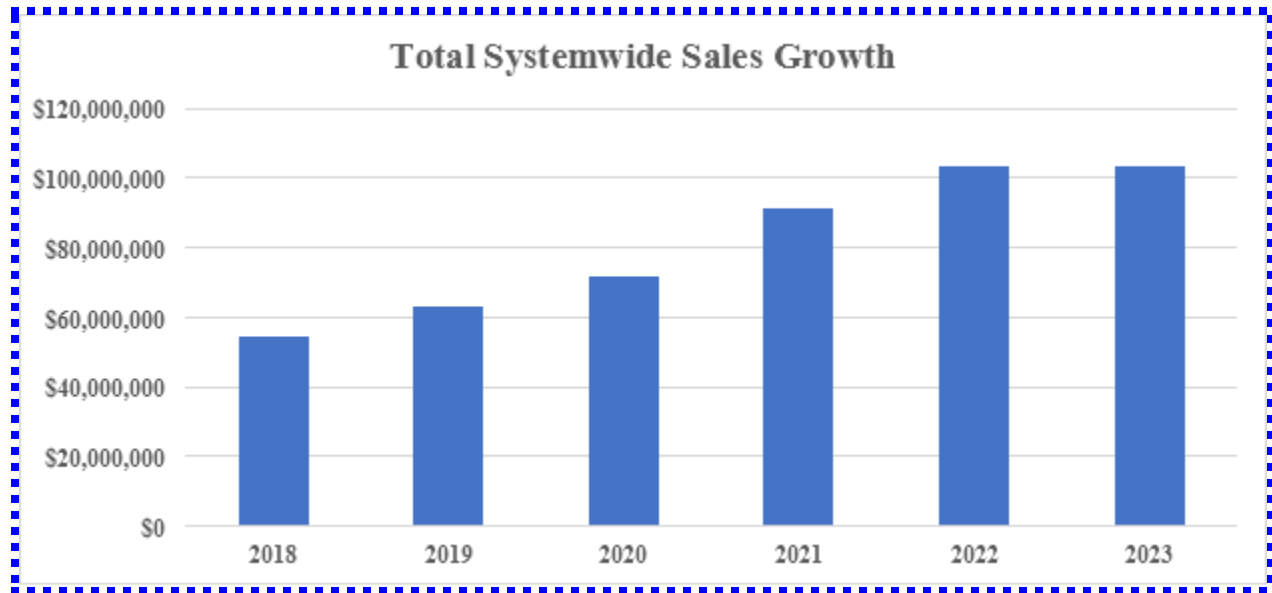
Table 1 sets forth the aggregate Gross Revenue (“ Systemwide Sales ”) reported to us and our predecessor from all franchisees whose franchised businesses were operational for any part of the year. See Note 1 to this table for the definition of “Gross Revenue.”