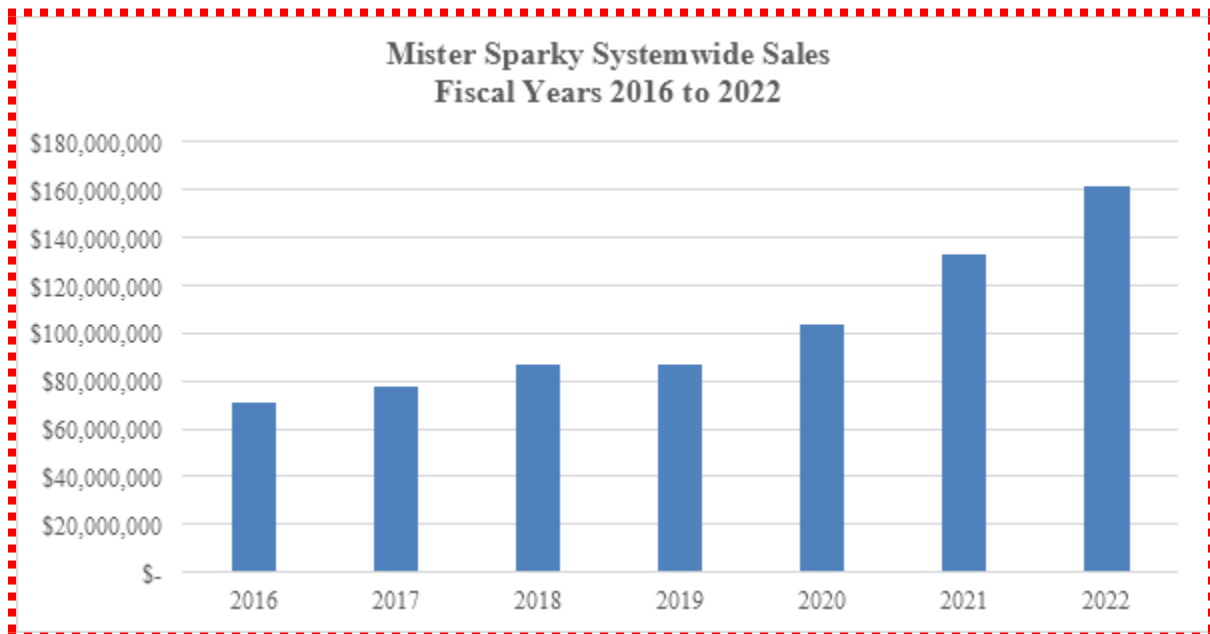
Table 4 sets forth the aggregate Gross Revenue (“Systemwide Sales”) reported by all MISTER SPARKY franchisees whose MISTER SPARKY Franchised Businesses businesses were operational for any part of the respective calendar years year (even as little as one month if the franchisee completed initial training in December of their initial year). See Note 3 to Table 1 for the definition of “Gross Revenue.”