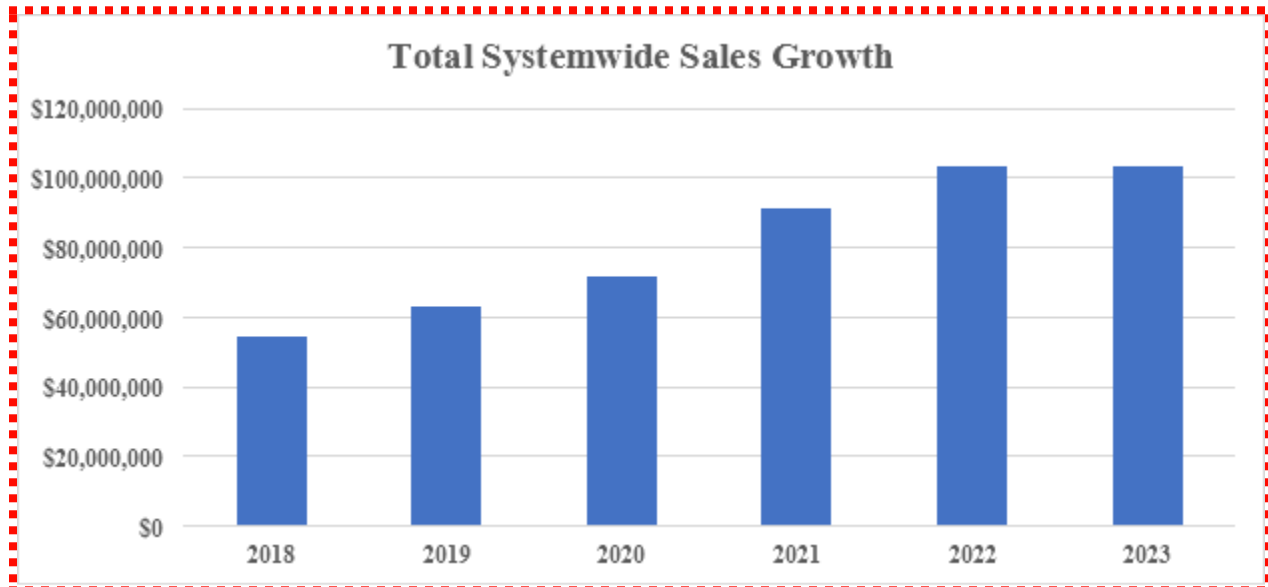
Table 1 sets forth the aggregate Gross Revenue (“ Systemwide Sales ”) reported to us and our predecessor from all franchisees whose franchised businesses were operational for any part of the year. See Note 1 to this table for the definition of “Gross Revenue.”