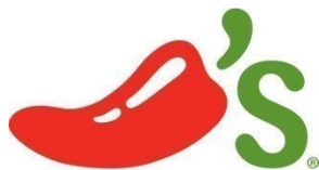
TABLE OF CONTENTS OF CHILI'S® FRANCHISE MANUAL