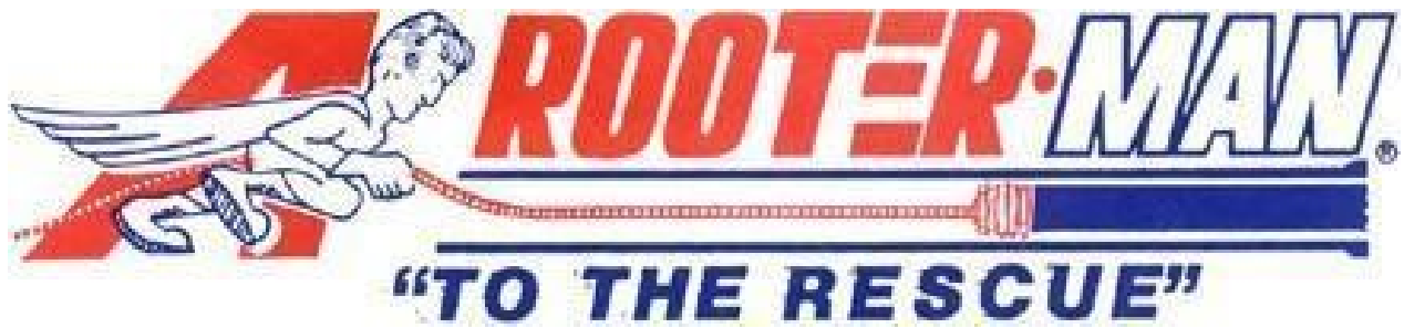
EXHIBIT C TO THE FRANCHISE DISCLOSURE DOCUMENT