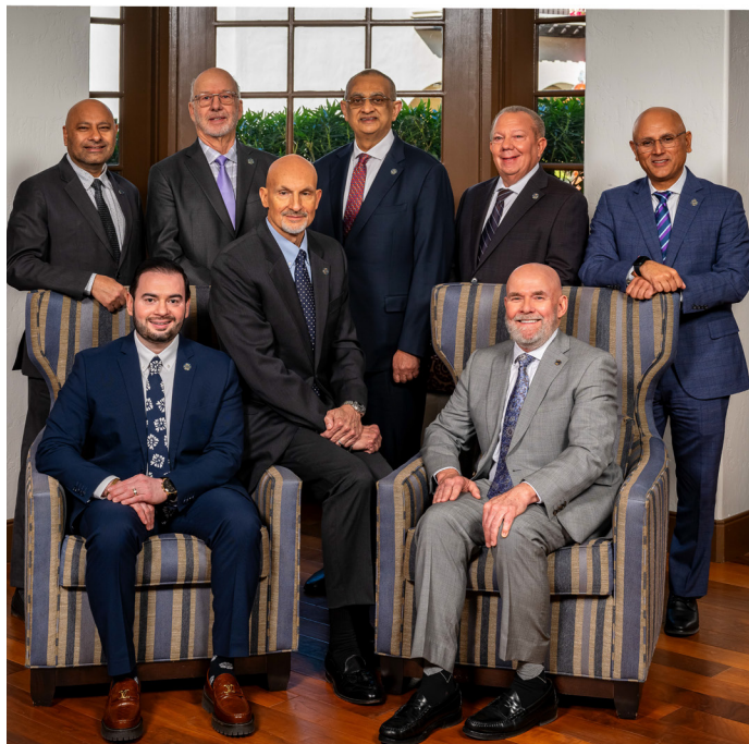
2025 BWH® Hotels Board of Directors and President and Chief Executive Officer, clockwise from far left, rear: