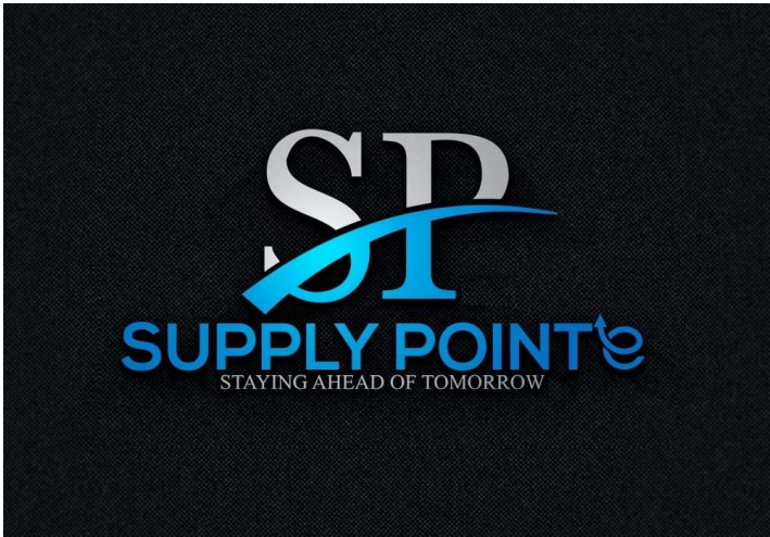
EXHIBIT B TO THE DISCLOSURE DOCUMENT